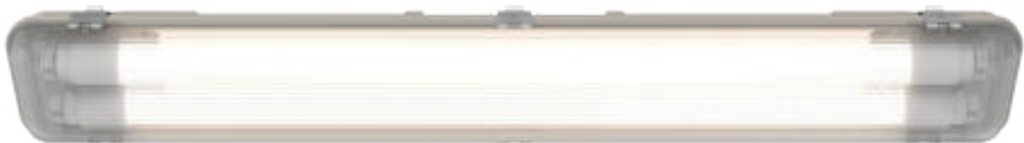
2 x LED T8